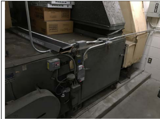
Heating and Ventilating Unit (HV)