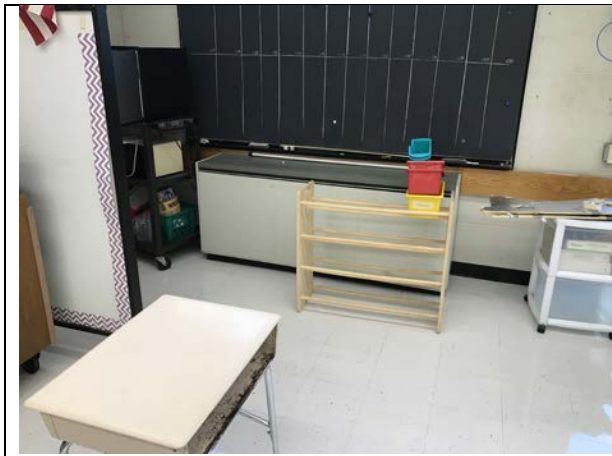
Classroom Unit Ventilators