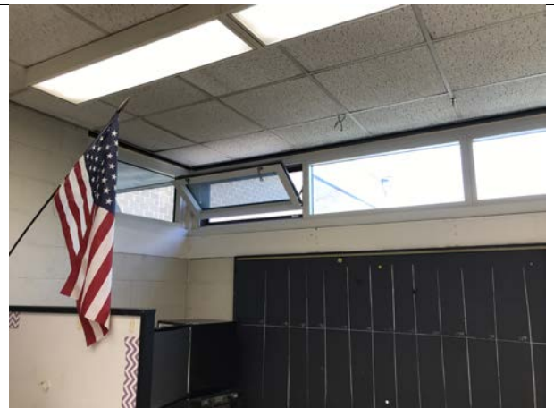
Classroom Operable Windows