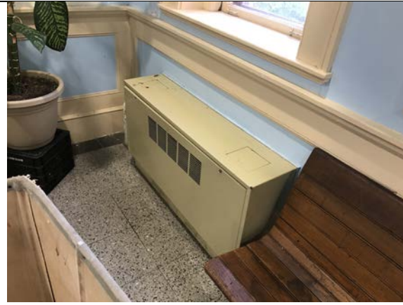
Unit Ventilator in Entrance