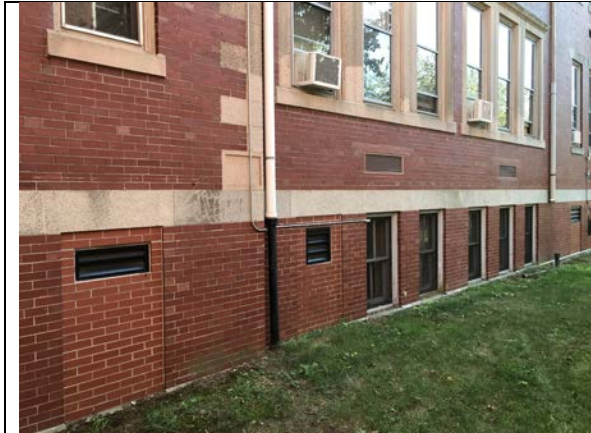
Unit Ventilator Outdoor Air Intake