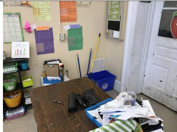
2 nd Floor Classroom Exhaust