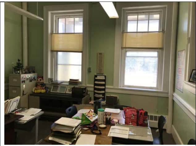
Classroom Unit Ventilator