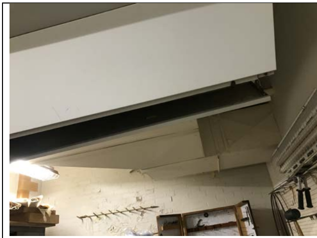
Woodshop HV Unit