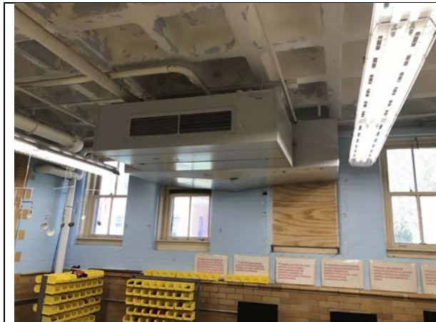
Robotics HV Unit