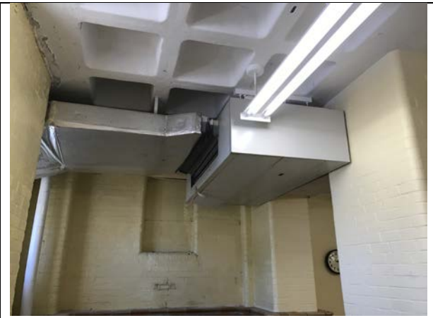
Main Cafeteria HV Unit