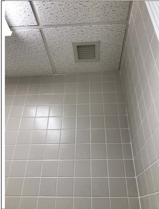
Typical Bathroom Exhaust Vents