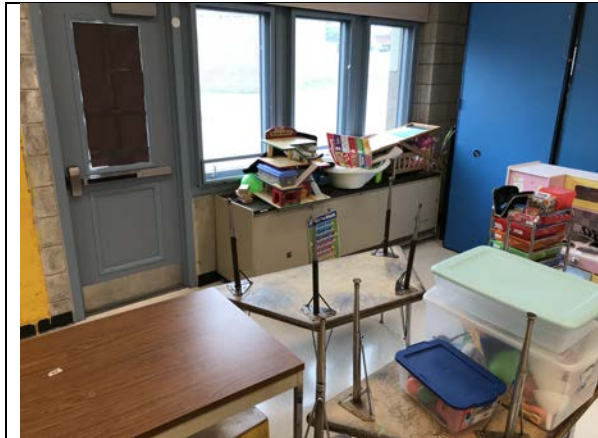
Classroom Unit Ventilator