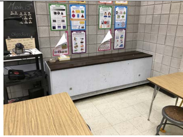
Classroom Unit Ventilator