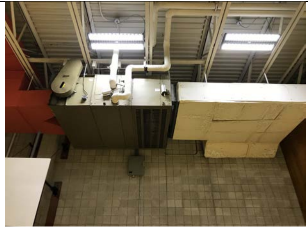
Gymnasium HV Unit