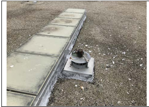
Typical Exhaust Fan (1)